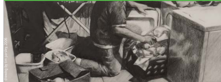
drawing by jim patelsky, 2006